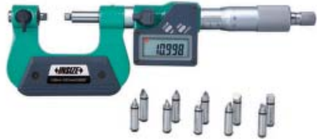
3581-S25 (measuring tips are included)