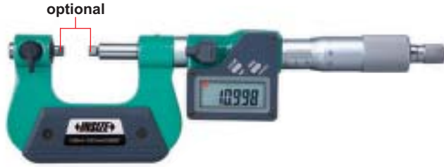
3581-25A (measuring tips are optional)